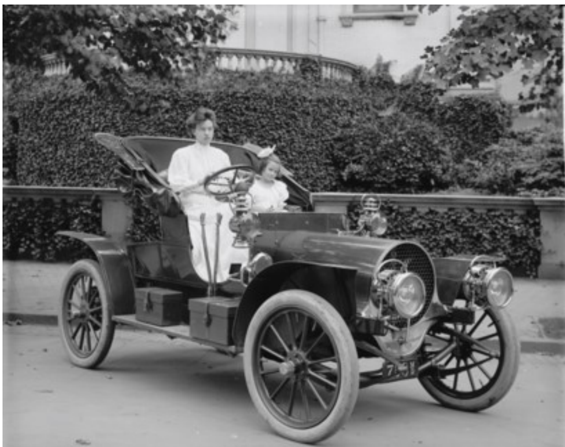
Figure 1: Example figure caption